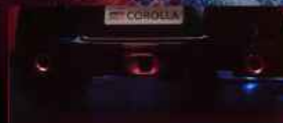
Exquisite Triple Pipe Exhaust System Boosted power output that exudes captivating sound.