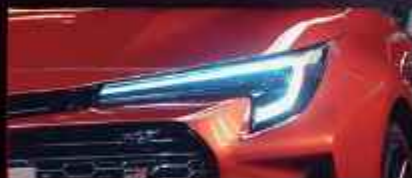
Radiant LED Headlamp with AHB Illuminating your path with an unmatched radiance.