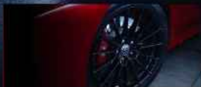
Dazzling Wheel 18" AL Multispoke Blast your stance with wheels that redefine the essence of automotive artistry.