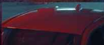
Sturdy Carbon Fiber Reinforced Polymer (CFRP) Roof Cutting-edge technology of lightweight and durable carbon fiber.