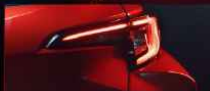
Luminous LED Rear Lamp & Rear Combination Lamp Transforming your vehicle's rear end into a spectacle of light.